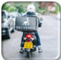
BREWDOG STARTS DELIVERY