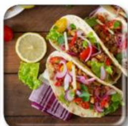
LUNCHTIME FOOD OFFER