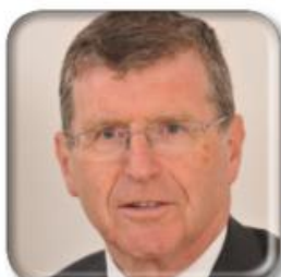
INNOVATION IS VITAL