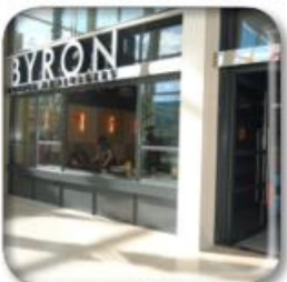
BYRON'S PROFITS SOAR