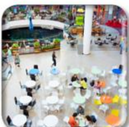
FOOD AND SHOPPING