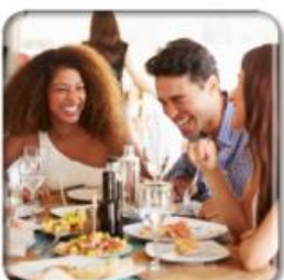
EATING OUT SPEND